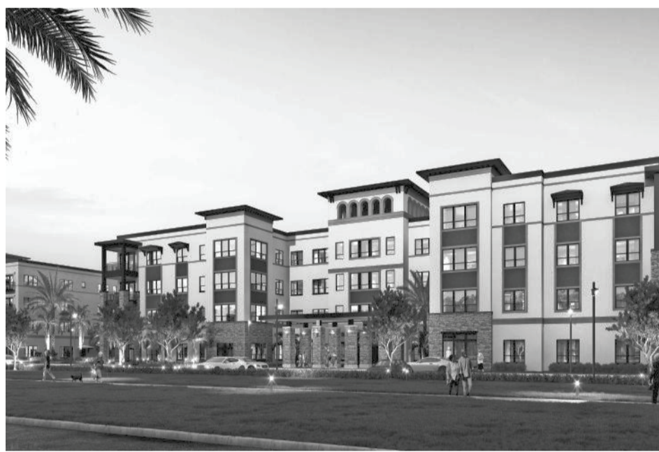
Construction started in December on Grand Living at Naples, a senior living community at 15150 Tamiami Trail N. Completion target: summer 2023. The plan: a 241,071-square-foot, four-story community with 206 units.