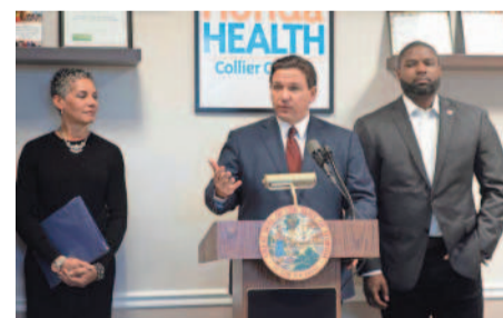
Gov. Ron DeSantis speaks during a press conference Jan. 4 at the Florida Department of Health-Collier County in Naples.