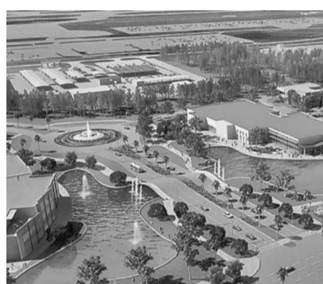
Artist's rendering of the potential for the Lee Port Authority's Skyplex when fully developed. The county approved the search for a real estate company to market 1,150 acres.

The iconic structure once was the place to be for members of the Black community who were not welcome in the dance halls and restaurants in the center of Fort Myers.